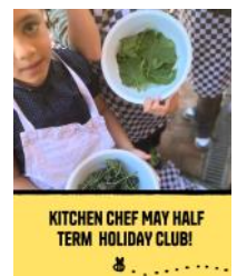
KITCHEN CHEF MAY HALF TERM HOLIDAY CLUB!

Places are limited, so we recommend booking as soon as possible! Click here to book